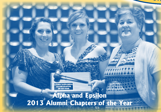
Alpha and Epsilon 2013 Alumni Chapters of the Year