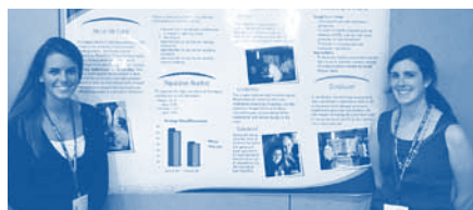
Xi Chapter, Poster Presentation Winner

Back at the hotel, 12 chapters presented posters featuring activities and projects that demonstrate the Core Values of LKS, with Xi Chapter taking top honors.