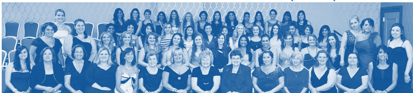
Our convention hosts, Alpha Collegiate and Alumni Chapters