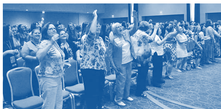
LKS members enjoy the Anita Renfroe performance!