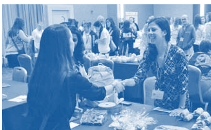
Connections were made at the Ewe Can Shop event.

Local vendors and LKS chapters displayed their wares at the Ewe Can Shop event, providing a fun and energetic marketplace to purchase specialty items and LKS wearables. Members were also able to bid on silent auction items benefitting the Educational Trust.