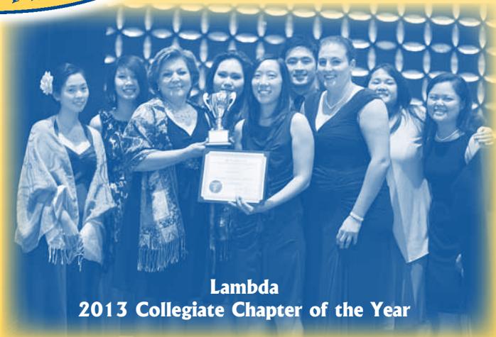
Lambda 2013 Collegiate Chapter of the Year

Turn to page 4 to see how we were welcomed home to Boston!