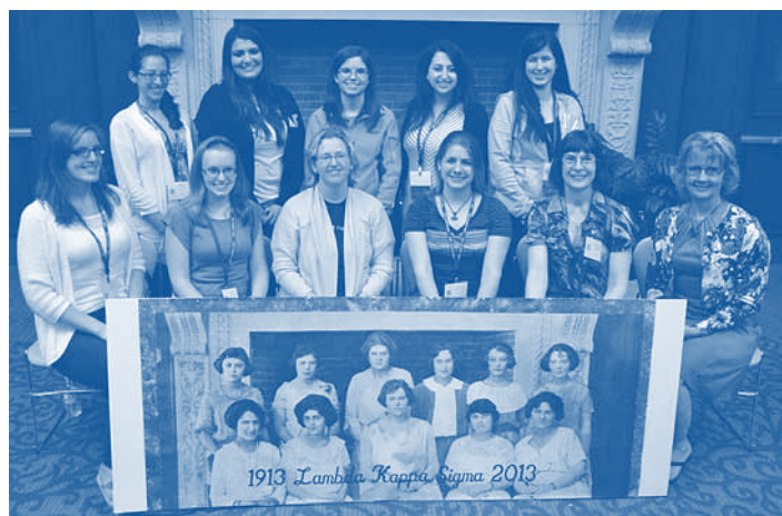
Omicron Chapter members posed in front of the MCPHS fireplace, reenacting the 1913 Founders photo.