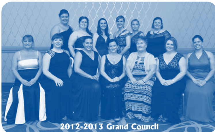
2012-2013 Grand Council

With all of that being said, we cannot forget those who have remained active sisters for 10, 20 or even 50 years. The Grand Council is working hard to find a way to marry the needs of all of our mem- bers. Every sister has something to offer, and we can all learn from the experiences and perspectives of those around us.