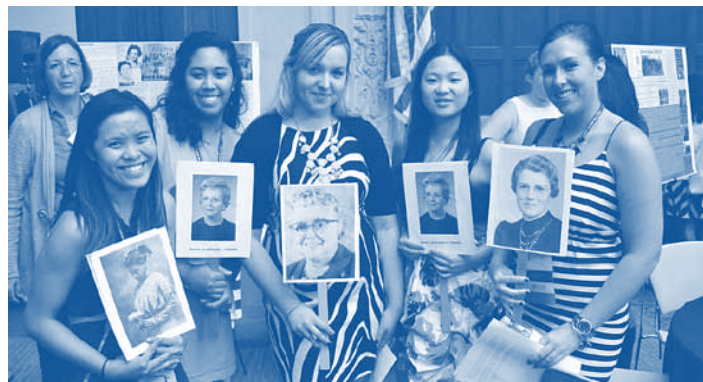
Alpha Chapter sisters served as “Founding Member” tour guides at the MCP Welcome Reception.