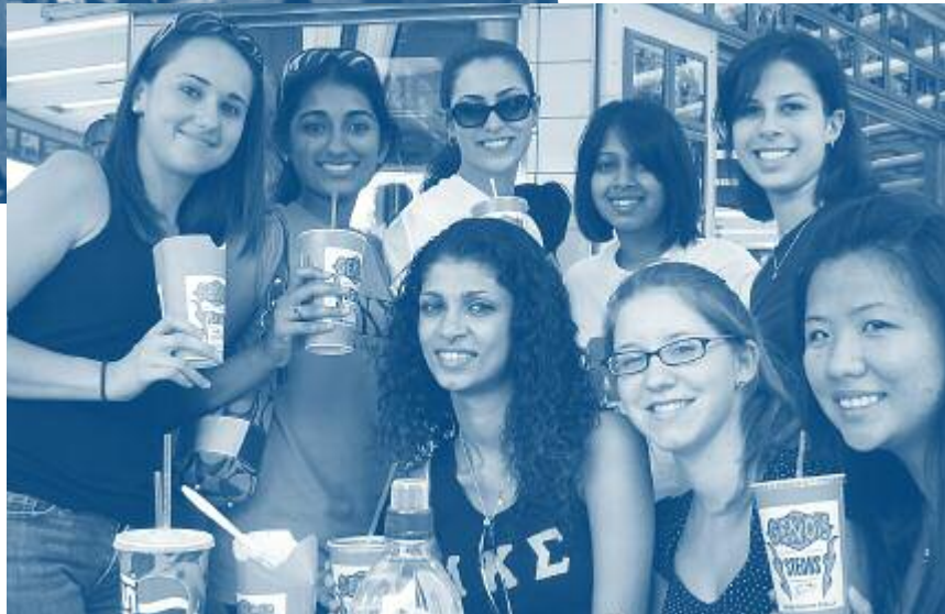
Members of Alpha Pi gather at the famous Philadelphia eatery, Genos, for Philly Cheese Steaks and refreshments.