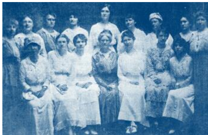
Women Pharmacists at Atlantic City A. Ph. A. Meeting, 1916