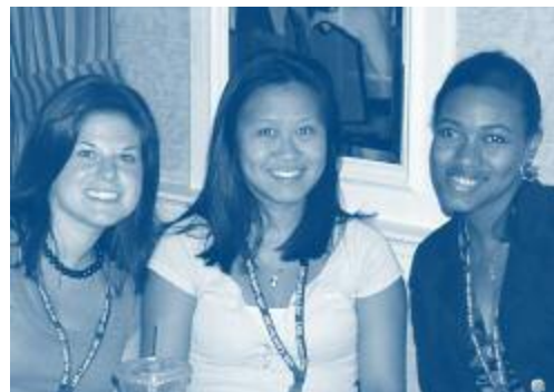
Students enjoy some sister time during the Regional Meeting in Philly.