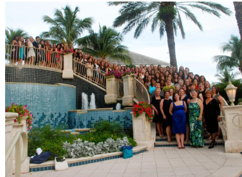
2014 Lambda Kappa Sigma Convention in Naples, FL

Stay tuned for more information regarding the 2015 Lambda Kappa Sigma Annual Convention, which will be held in St. Louis from July 29 through August 1!