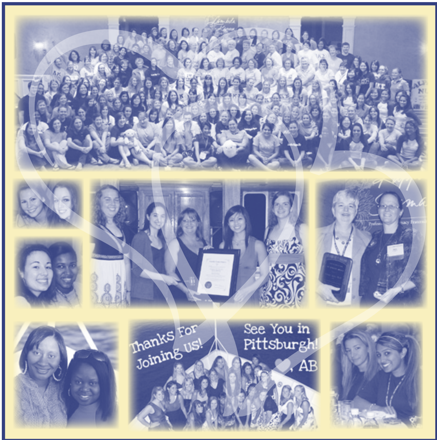
Photos from the Regional Meeting – Summer 2009 Hartford, Connecticut (see related article pages 6-7)

"Promoting the Profession of Pharmacy Since 1913"